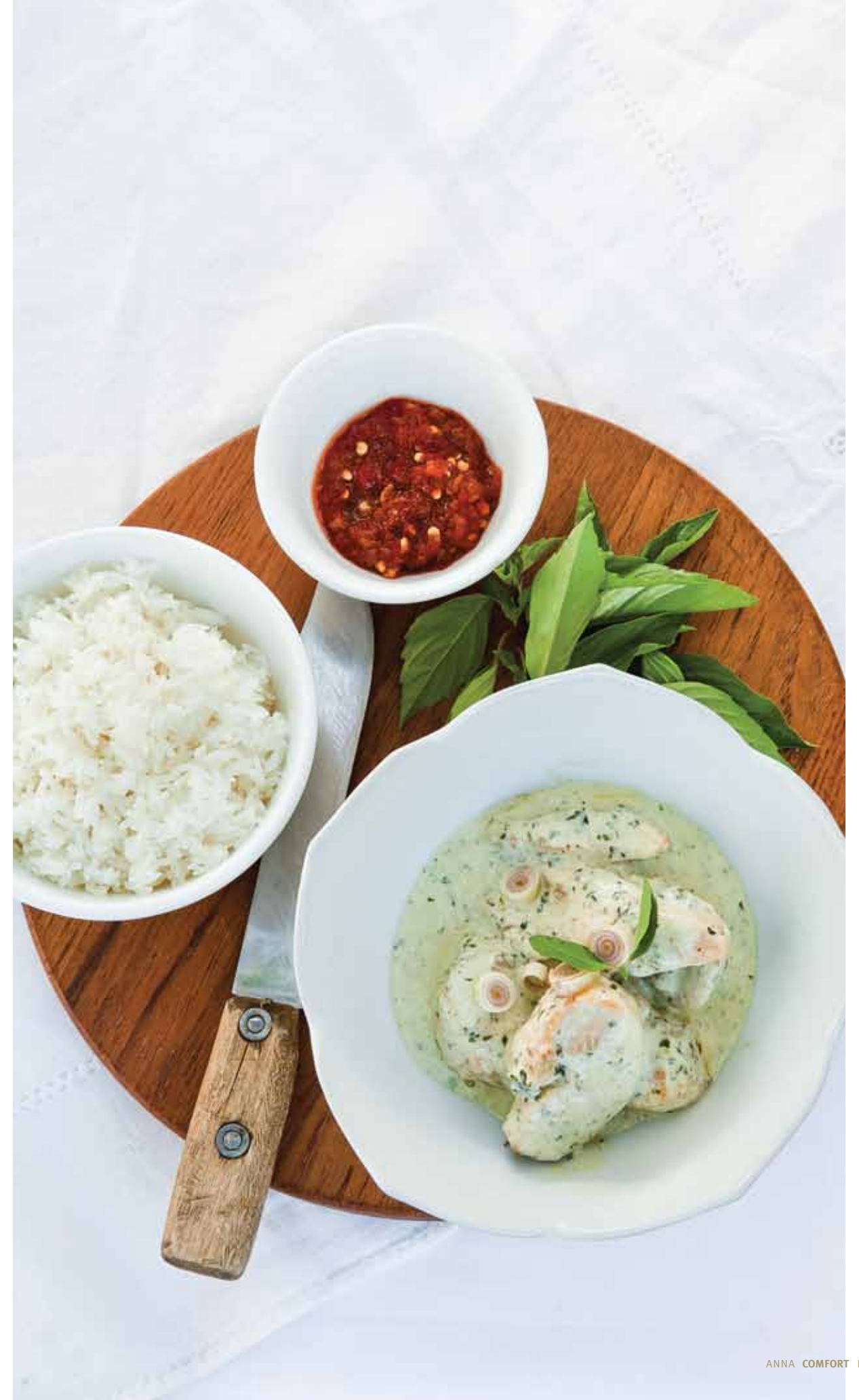
Vintage knife, Sheilagh Wardrop

Heat remaining oil in wok over high heat. Add garlic and chicken; cook 2 to 3 minutes until chicken is only slightly pink. Add tofu and cook 1 minute longer. Stir in eggs. Add noodles, tamarind juice, fish sauce, vinegar, sugar and sambal; cook for 3 minutes. Add shrimp and cook 2 to 4 minutes longer. Add peanuts; toss to coat. Remove from heat. Sprinkle with bean sprouts and cilantro. Serves 8.