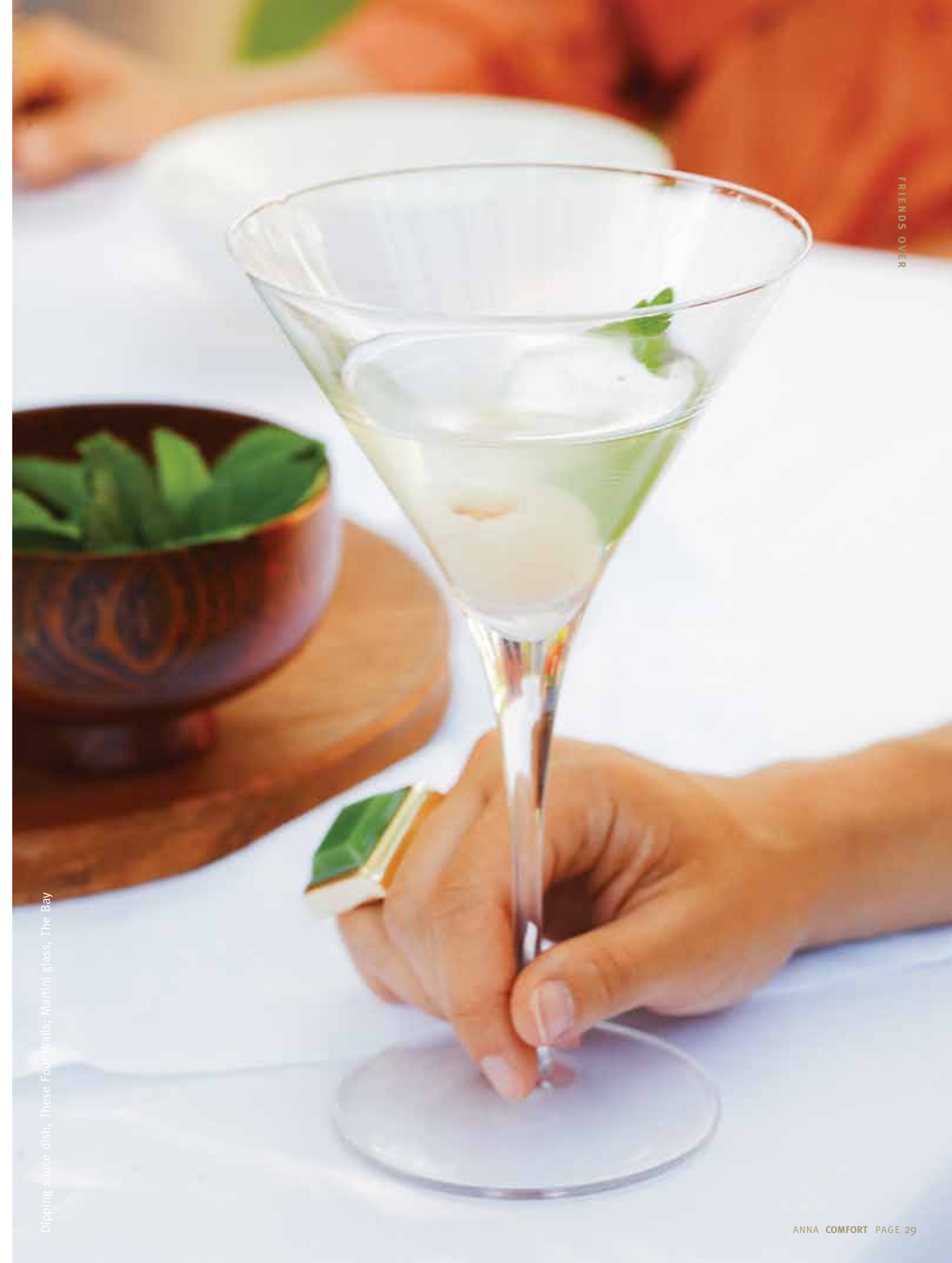
Dipping sauce dish, These Four Walls; Martini glass, The Bay